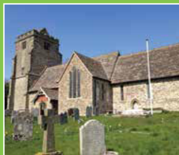
St Mary's Church THAKEHAM