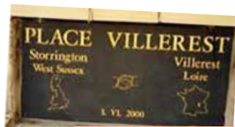
Plaque in Storrington village centre

In 1996, 24 members of the Twinning Association visited Villerest, in Rhone Alps. They were royally received and returned in the highest of spirits. In May 1997, 36 people from Villerest, led by the Mayor, arrived in Storrington. 160 friends and supporters watched the signing of the Charter, formally linking the two Communities. Our local Parish Councils were also represented and both National Anthems were played by a small wind band from Rydon School.