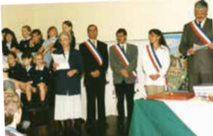
The Twinning Ceremony at Storrington First School in May 1997

supporters to take part in this event. Please do not hesitate to contact the secretary@storringtontwinning.co.uk or to look at our website on Storringtontwinning.co.uk.