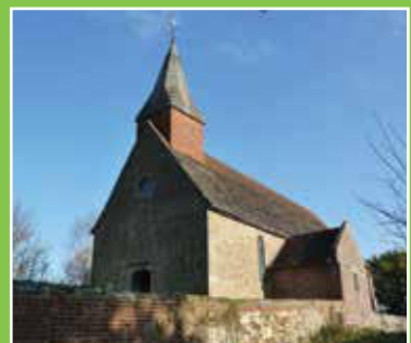
Holy Sepulchre WARMINGHURST (Churches Conservation Trust)