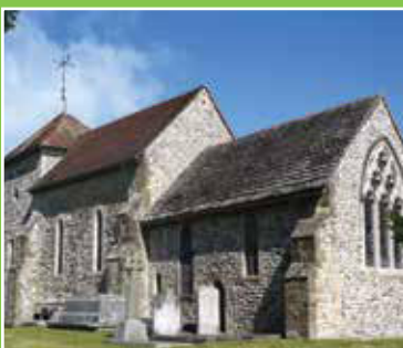
St Mary's Church SULLINGTON