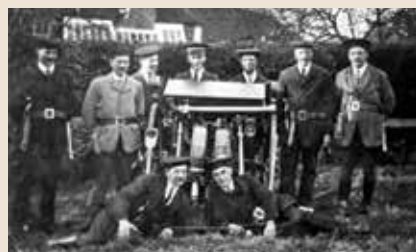
Fire volunteers with hose truck