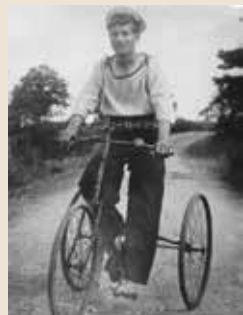
Local sailor from Cootham