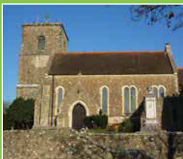
St Mary's Church STORRINGTON